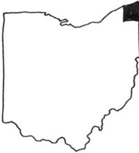
State of Ohio: Ashtabula County, in black, is located in the northeastern corner on the shores of Lake Erie.

Ashtabula County, in the northeast corner of Ohio, typifies the ways American life has changed during the last two centuries. Settlers began to arrive in the late 1700s and, throughout the 1800s, the county gradually filled with small family farms. Villages emerged as complements to the rural life around them, often located near a gristmill or sawmill. Finally, towns appeared “as foreign bodies set down, like boulders on a plain.” 2 As people’s circumstances changed, they measured their possibilities by a succession of different rhythms.